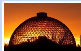
Desert Dome, Henry Doorly Zoo & Aquarium

Symposium Website: http://AcousticCommunicationByAnimals.org/